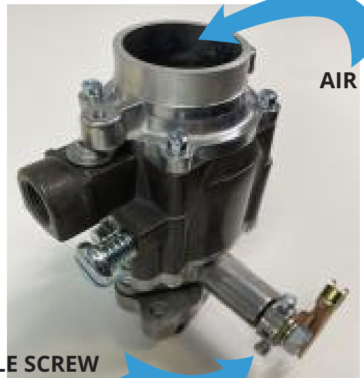
RPM IDLE SCREW