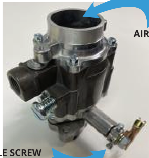
RPM IDLE SCREW