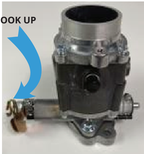
CABLE LINKAGE HOOK UP

This setting is preset at the factory and should not require adjustment. This adjustment is only effective when the engine is near full load condition. NOTE: Can only be adjusted with the engine loaded, or close to the fully loaded condition. If adjustment is needed, follow these steps: 1. Set parking brake and block drive wheels. 2. Connect a Tachometer to the engine. 3. Accelerate engine to Full Rated RPM Level. 4. Pull backwards on Tilt Lever until pump reaches hydraulic relief bypass. The RPM should drop according to the specifications for the hydraulic bypass (Typically 250-500 RPM). If the RPM will not drop, check and adjust your hydraulic pressure to the manufacturer's specifications before continuing. 5. Turn the Power Adjustment Valve until the highest engine RPM is reached. NOTE: Using an exhaust gas analyzer your percentage of CO should be (.50% - 1.0%).